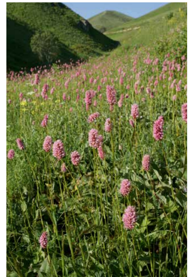
Persicaria bistorta var. carnea

Lilium ciliatum is confined to a few valleys between Giresun and Rize, but it can be locally very common. During past trips I had successfully shown all of region's lilies including ivory-flowered L. akkusianum an even more range restricted lovely found only around Erbaa and the Akkus Valley. However, the lush lily heartland is to the east where L. ciliatum thrives often alongside the sweet-scented L. monodelphum var. armenum , as it does at the Zigana Pass