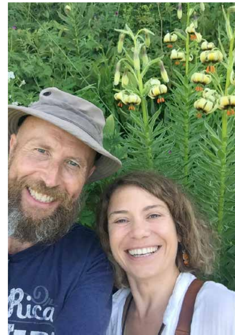
The Lily hunters

There was a super-abundance of other flowers as well and I spent early mornings up in the hills among great drifts of Persicaria bistorta var. carnea , the immense architecture forms of Heracelum platytaenium , flamboyant blue and white of Aquilegia olympica , big clumps of Stachys macrantha , tumbles of Lathyrus rotundifolius and vast carpets of Rhinanthus angustifolius mingled with the dark pink orchid; Dactylorhiza urvilleana . Other orchids included