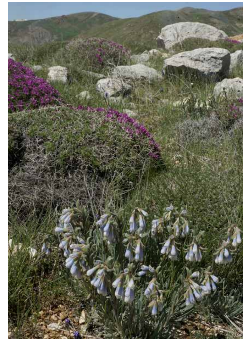
Onosma tauricum blue form

I'm still picking odd the spine out from where I'd rather not.