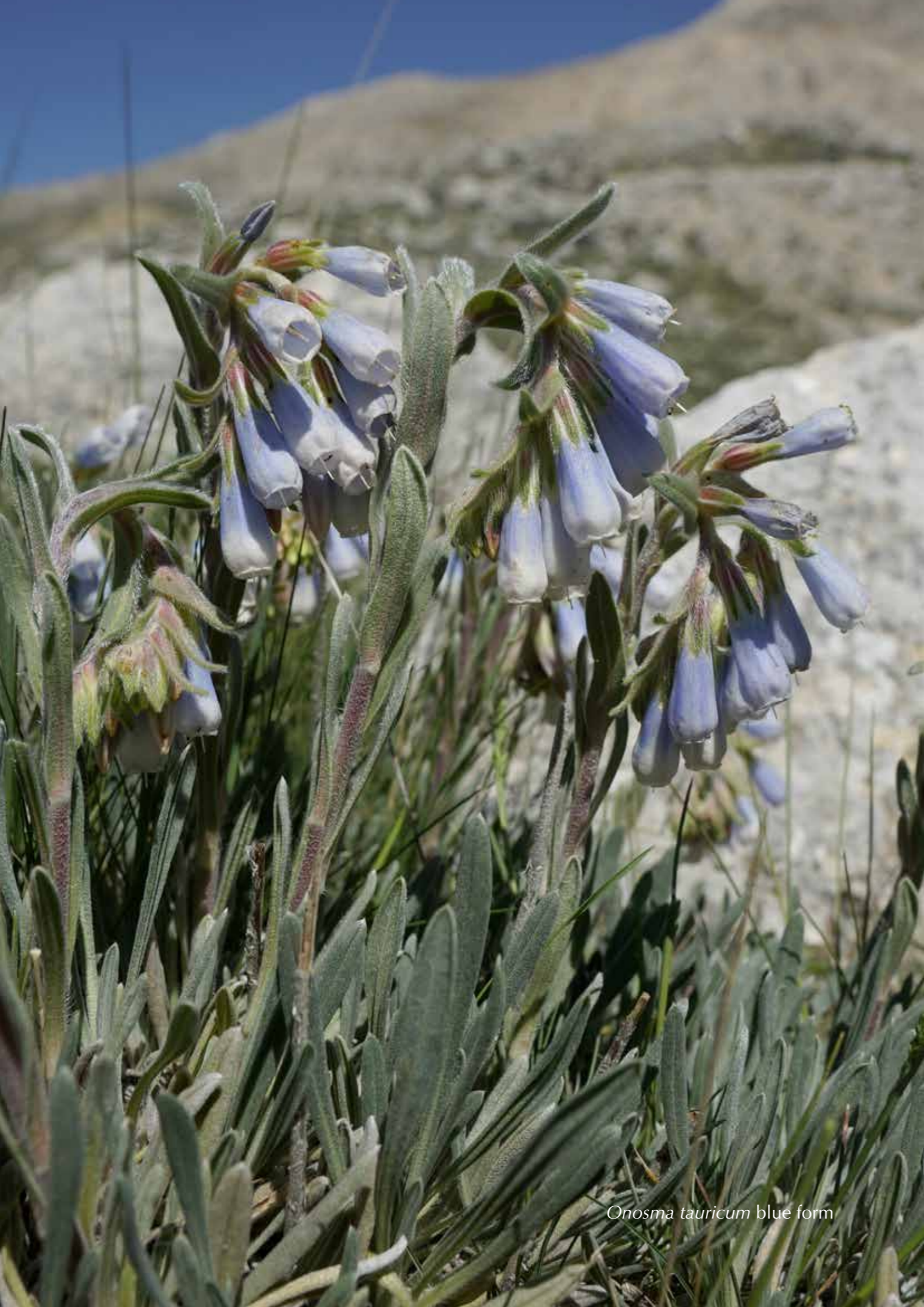
Onosma tauricum blue form